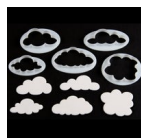
FMM Cutter Fluffy Cloud