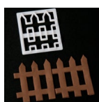
FMM Cutter Picket Fence