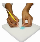
PME Flower Foam Pad