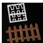
FMM Cutter Picket Fence