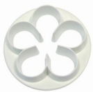
PME 5 petal cutter 50mm