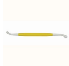
PME Modelling tools, Bone