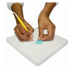
PME Flower Foam Pad