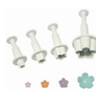
PME Flower Blossom Plunger Cutter set/4