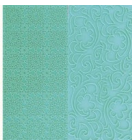
FMM Impression Mat Vintage Lace