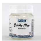
PME Edible Glue (Petal glue) 60g