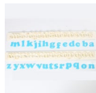
FMM Tappit Cutter Alphabet Tappits Lower Case Art Deco