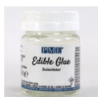
PME Edible Glue (Petal glue) 60g