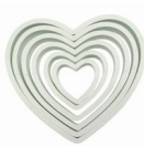
PME Plastic Cutter Heart Set/6