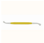
PME Modelling tools, Bone