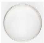
Cookie Cutter Ring Ø 5 cm