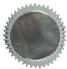
PME Mini Baking cups Silver pk/45