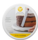
Wilton Basic Turntable