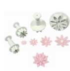
PME Plunger Cutter Daisy Marguerite set/4