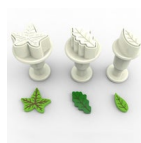
Dekofee Mini Plunger Cutters Leaves set/3