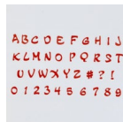
FMM Alphabet & Numbers Tappits Magical Upper Case