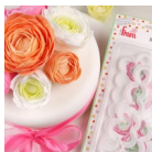
FMM Cutter The Easiest Ranunculus Ever