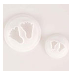
FMM Cutter Baby Feet