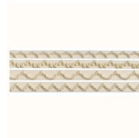
FMM Straight frill cutters no. 1