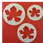
FMM Hawaiian Flower Cutters Set/3