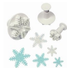
PME Snowflake Plunger Cutter set/3