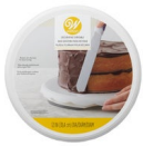
Wilton Basic Turntable