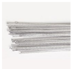
Culpitt Floral Wire Silver set/50 -24 gauge-