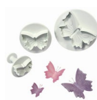
PME Plunger Cutter Butterfly set/3