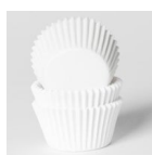
House of Marie Mini Baking Cups White pk/60