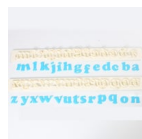
FMM Tappit Cutter Alphabet Tappits Lower Case Art Deco