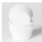
House of Marie Mini Baking Cups White pk/60