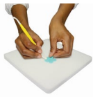
PME Flower Foam Pad