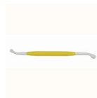
PME Modelling tools, Bone