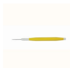
PME Modelling Tool Scriber Needle