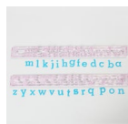
FMM Tappit Cutter Alphabet Lower Case