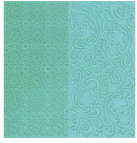
FMM Impression Mats Vintage Lace set/2