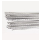
Culpitt Floral Wire Silver 24 Gauge set/50