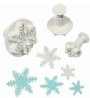
PME Plunger Cutter Snowflake set/3