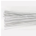
Culpitt Floral Wire White set/20 -20 gauge-