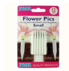
PME Flower Pics Small pk/12