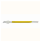
PME Modelling tools, Bulbulous cone