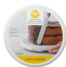
Wilton Basic Turntable